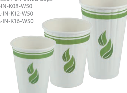
Compostable Insulated PLA-Lined Cups 8 oz: EG-PL-IN-K08-W50 12 oz: EG-PL-IN-K12-W50 16 oz: EG-PL-IN-K16-W50