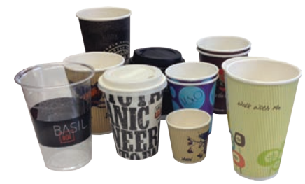
FREE Custom Printing Minimum quantities apply. BPI sublicense available.